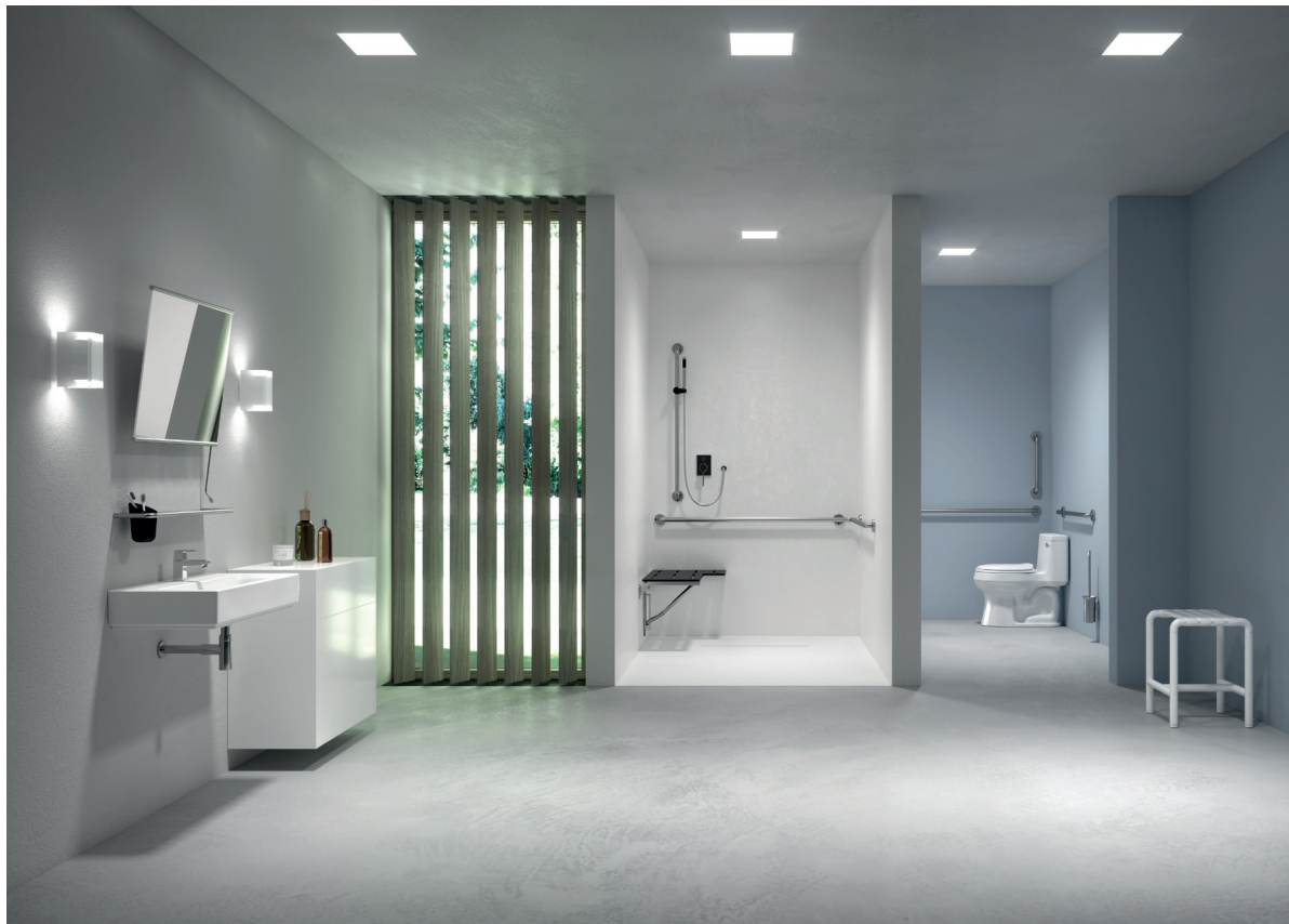
PROGRAMMA 400-SS STAINLESS STEEL SUPPORTS AND BATHROOM ACCESSORIES