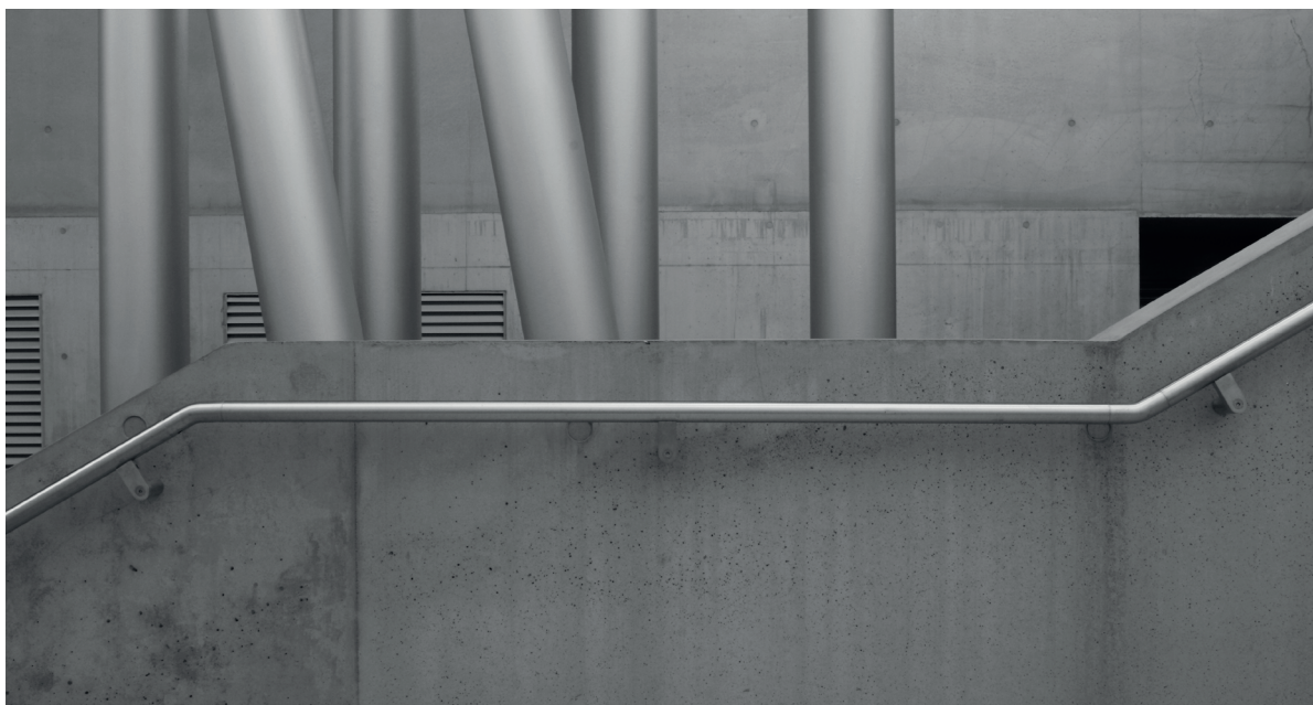
PROGRAMMA 400-HR STAINLESS STEEL HANDRAIL

PBA ANTI-MICROBIAL COATING (AMC) IS COLOURLESS, HENCE INVISIBLE: THE PRODUCTS HAVE A AMC LABEL ON THE BACK TO KEEP SEPARATED FROM UN-FINISHED PRODUCTS.