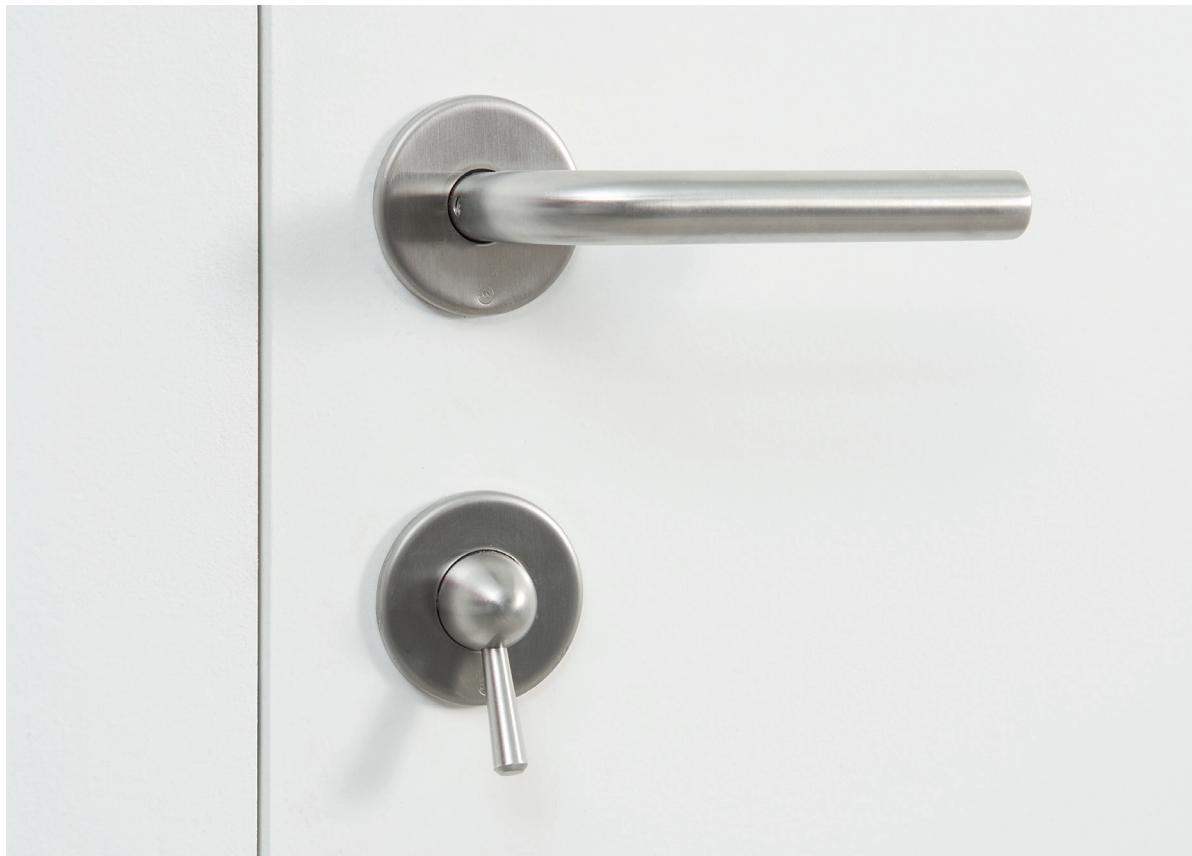
PROGRAMMA 2000 STAINLESS STEEL HANDLES AND DOOR ACCESSORIES

HOW MANY TIMES A DAY HANDRAILS, HANDLES AND LEVERS ARE TOUCHED BY DIFFERENT HANDS EVERYWHERE AND SPECIFICALLY IN PUBLIC SPACES, OFFICES AND HOSPITAL?